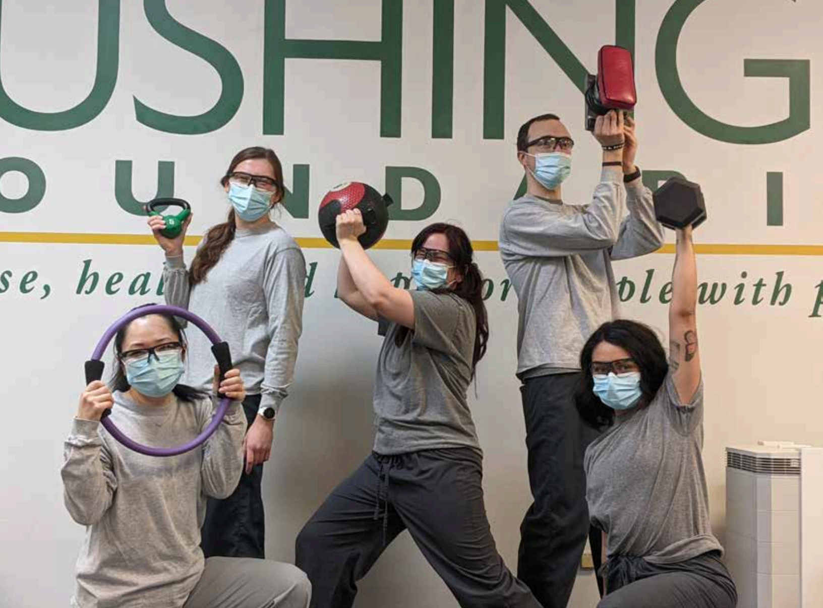
The exercise therapy team all have bachelor's degrees in exercise science or kinesiology. In addition to more standard exercise therapy certifications, they are all also Certified Inclusive Fitness Instructors.