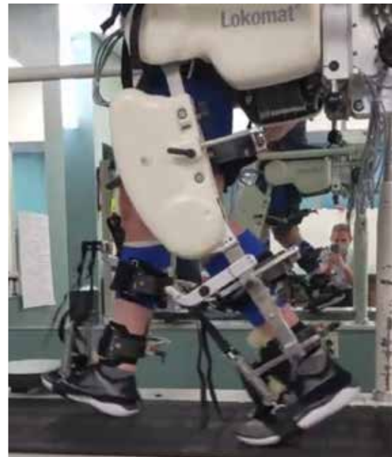
The Lokomat® Robotic gait training system can be used by clients of almost any function level and can be uniquely programmed for each client to provide maximum therapeutic benefit.

“WE PROVIDE AN ONLINE RESOURCE CENTER THAT ANYONE CAN USE, whether they come for exercise therapy or not.”