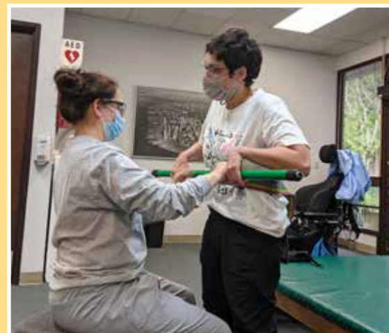
Strength and coordination exercises can increase dexterity and movement.